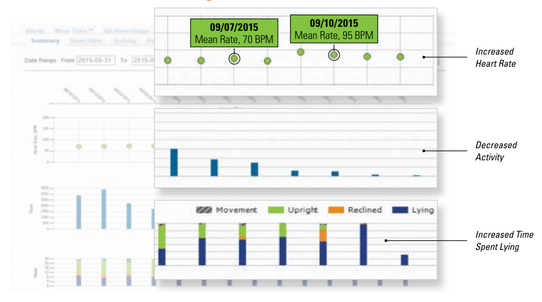
Figure 2. Portion of the patient's LifeVest Trends Summary displaying average increased heart rate, decreased activity, and increased time spent lying.