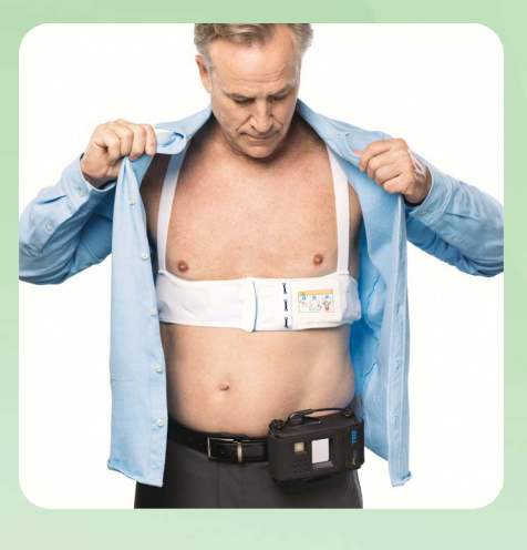
The lightweight, lowprofile garment provides comfortable support as you return to daily activities.