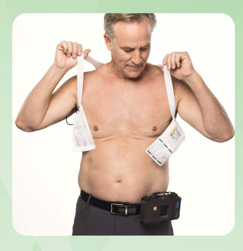
The LifeVest garment slips on easily and is worn under your clothes, against the skin.

Lightweight. Easy to use. But most importantly, effective. LifeVest has been trusted to provide protection to at-risk patients for more than 20 years.<sup>1</sup>