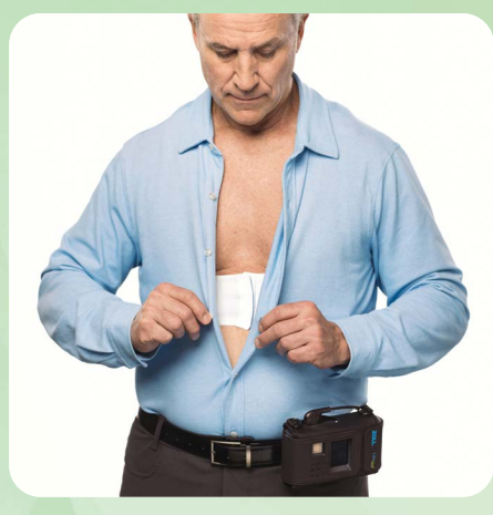
The monitor can be worn around the waist or with a shoulder strap.